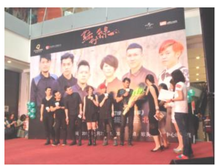
Taiwanese Band AK (Sep 2013)