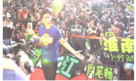
2<sup>nd</sup> Anniversary Celebration (Sep 2012)