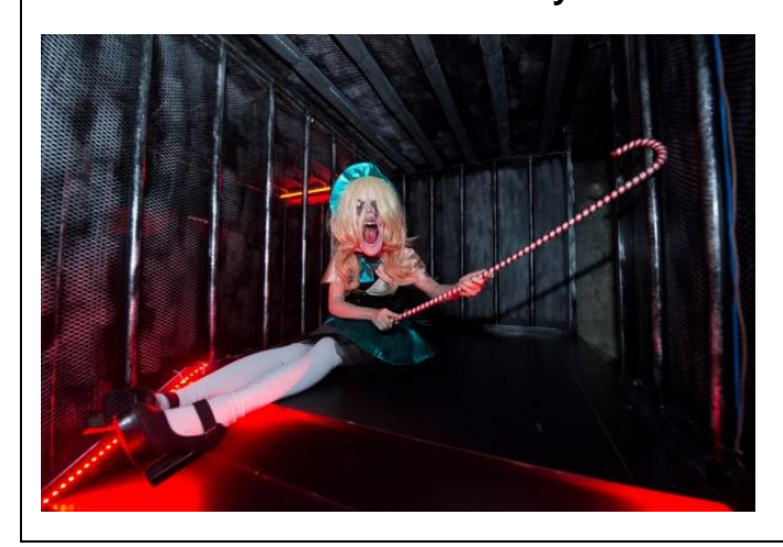
8<sup>th</sup> Zone: Final Destination Labyrinth

To break the spell of the circus troupe, you have to overcome all your nightmares. Are you going to succeed in escaping from the circus?