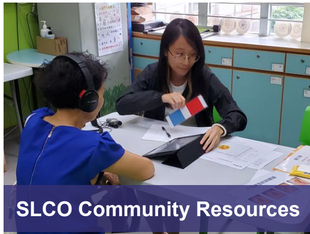
SLCO Community Resources