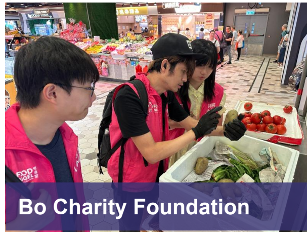
Bo Charity Foundation