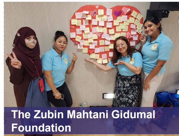
The Zubin Mahtani Gidumal Foundation