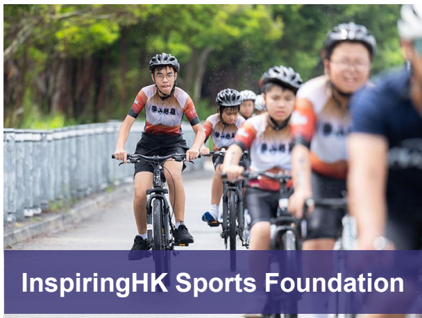
InspiringHK Sports Foundation