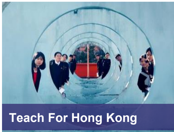
Teach For Hong Kong